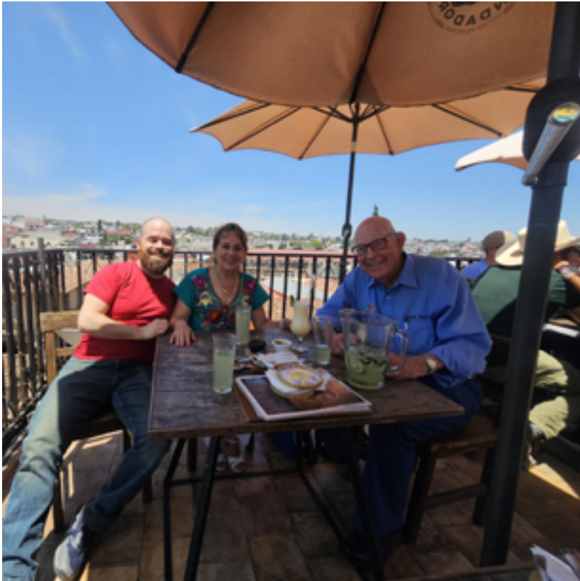
Roof Top Café