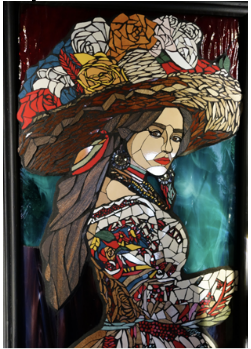
Lady with Hat