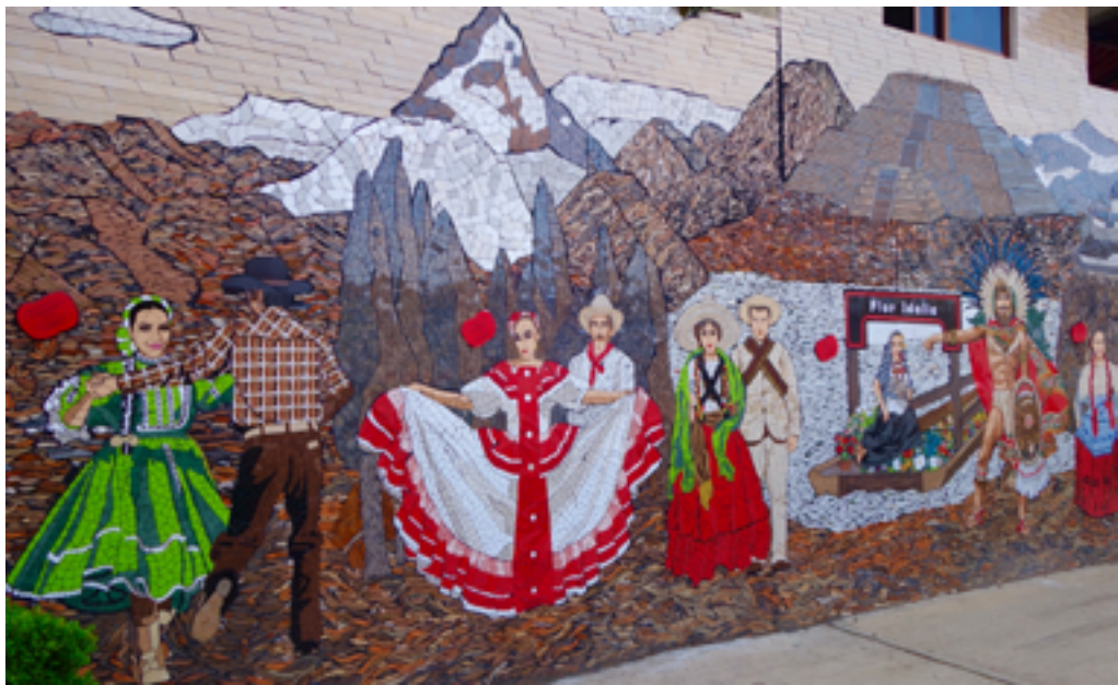
Homage to Mexican States, dancers