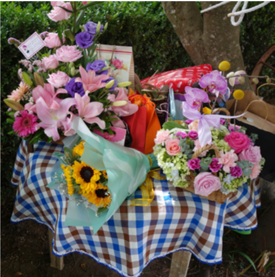
Flower display, one of many.