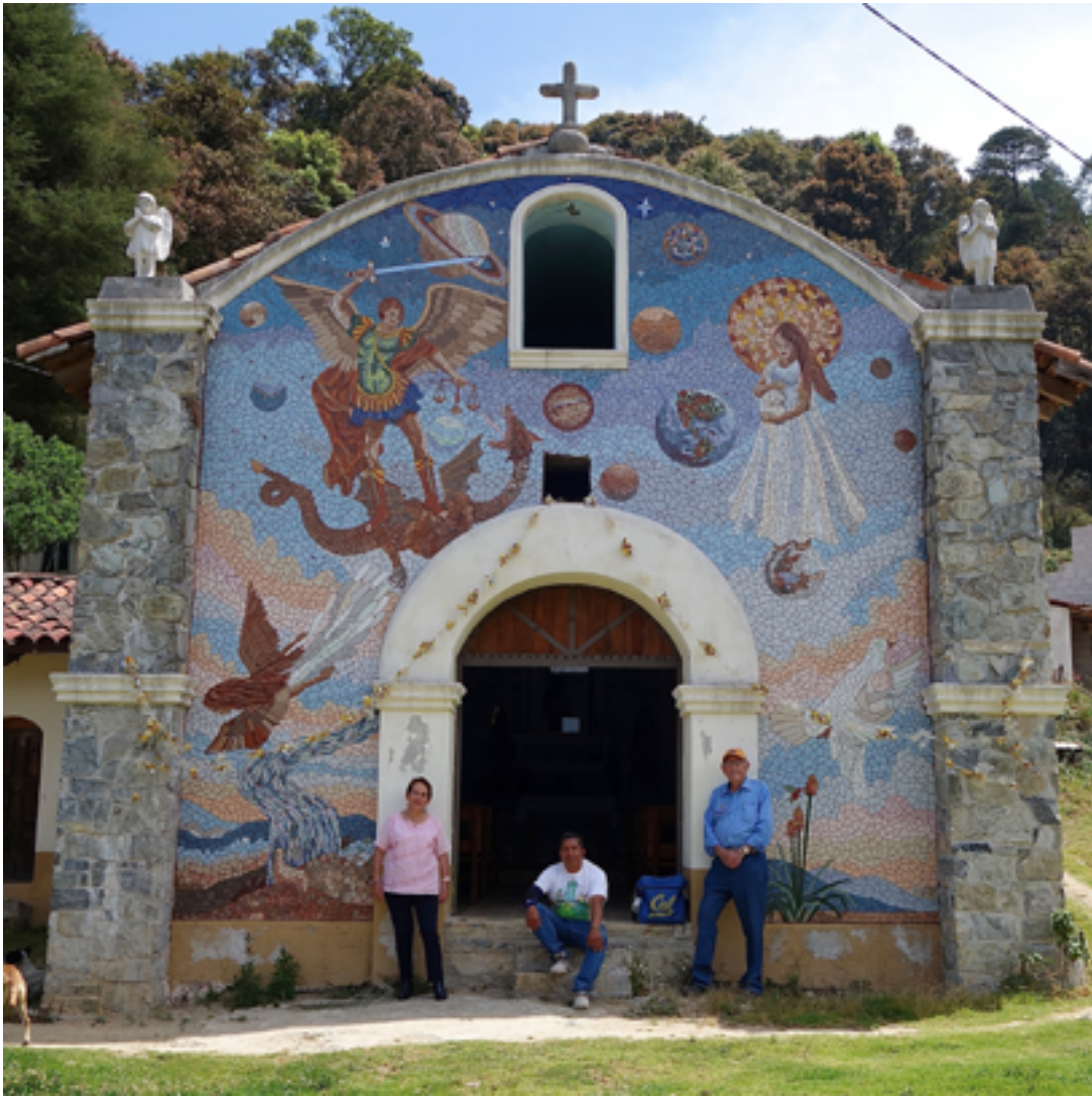
Community Chapel: San Miguel