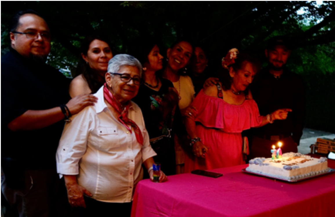
Birthday cake....2 candles, make 1 SEVENTY